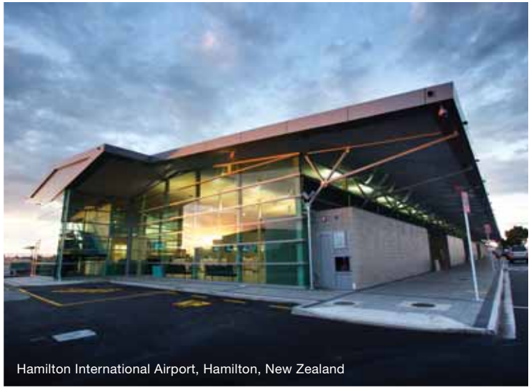
Hamilton International Airport, Hamilton, New Zealand

Visit coffey.com today and find out more about our specialist services