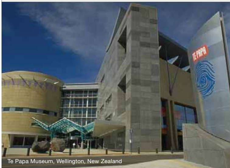
Te Papa Museum, Wellington, New Zealand