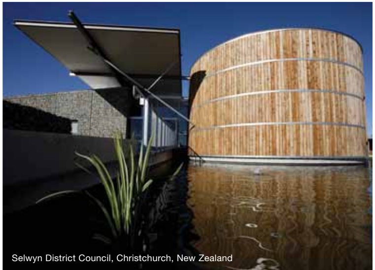
Selwyn District Council, Christchurch, New Zealand